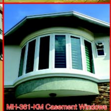
MH-361-KM Casement Windows