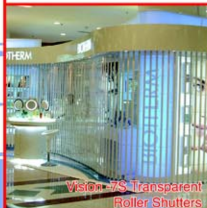
Vision-7S Transparent Roller Shutters