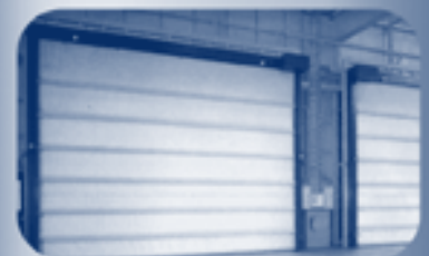
HIGH SPEED DOOR