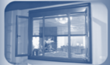
FIRE ESCAPE SAFETY