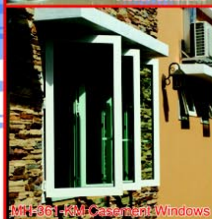
MH-361-KM Casement Windows