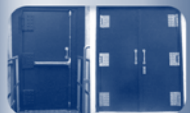
BLAST RESISTANCE STEEL DOOR