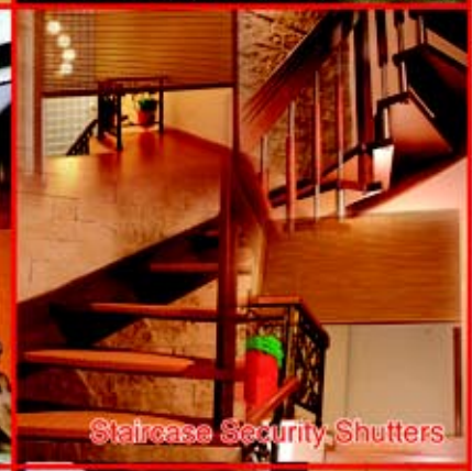
Staircase Security Shutters