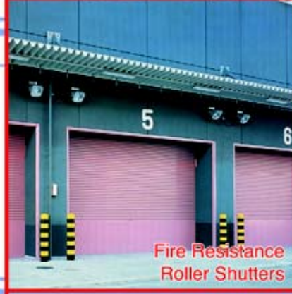
Fire Resistance Roller Shutters