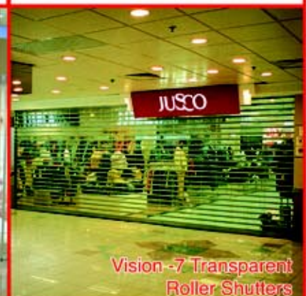
Vision-7 Transparent Roller Shutters