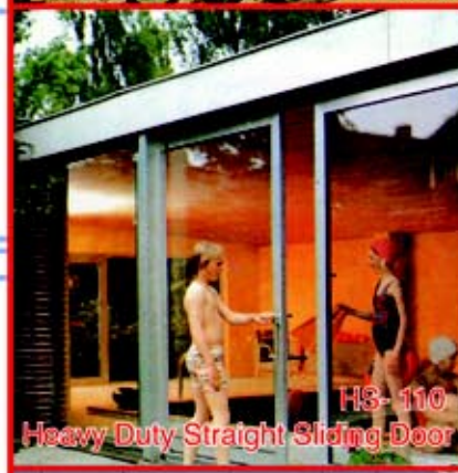
HS-110 Heavy Duty Straight Sliding Door