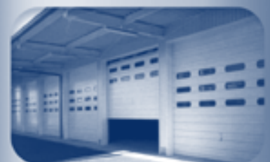
OVERHEAD DOOR Formula 1, Sepang