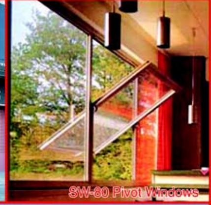
SW-80 Pivot Windows