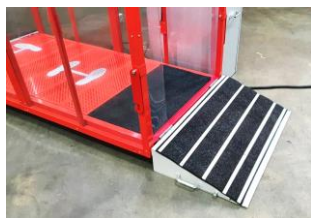
All-Footwear & Wheelchair-friendly