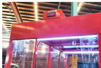
Pass-Through LED Foot Traffic Counter