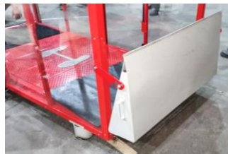
Foldable Ramp for Easy Mobilisation